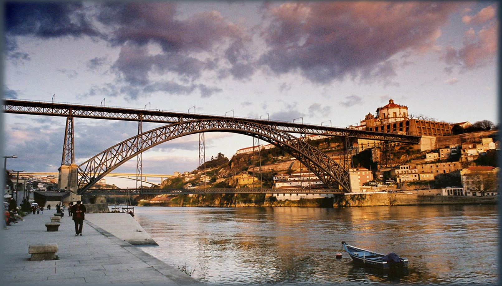
LUÍS I BRIDGE, 1886