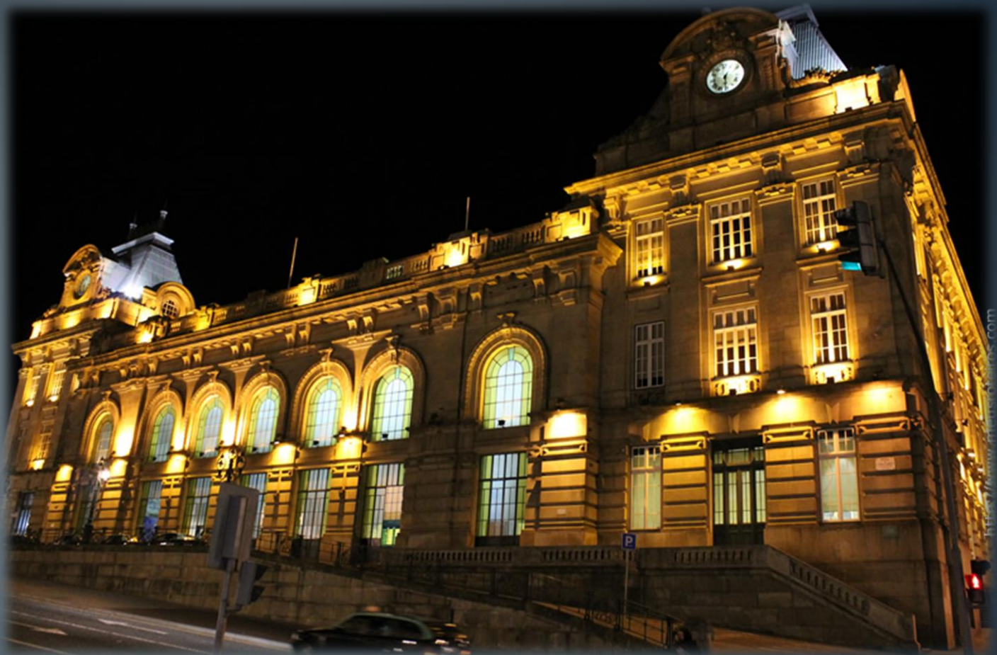
S. BENTO'S TRAIN STATION, 1916