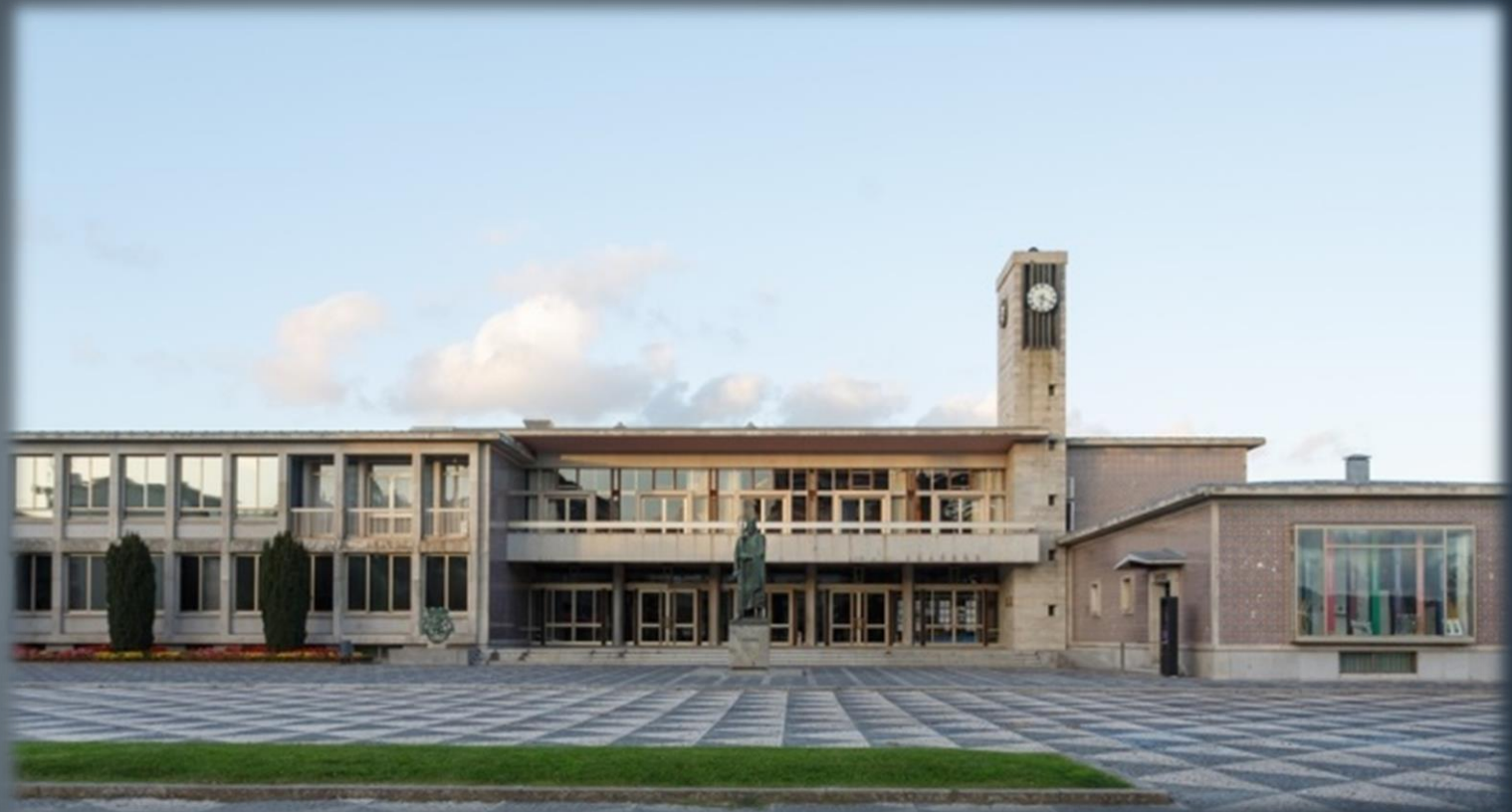
SANTO TIRSO'S TOWN HALL