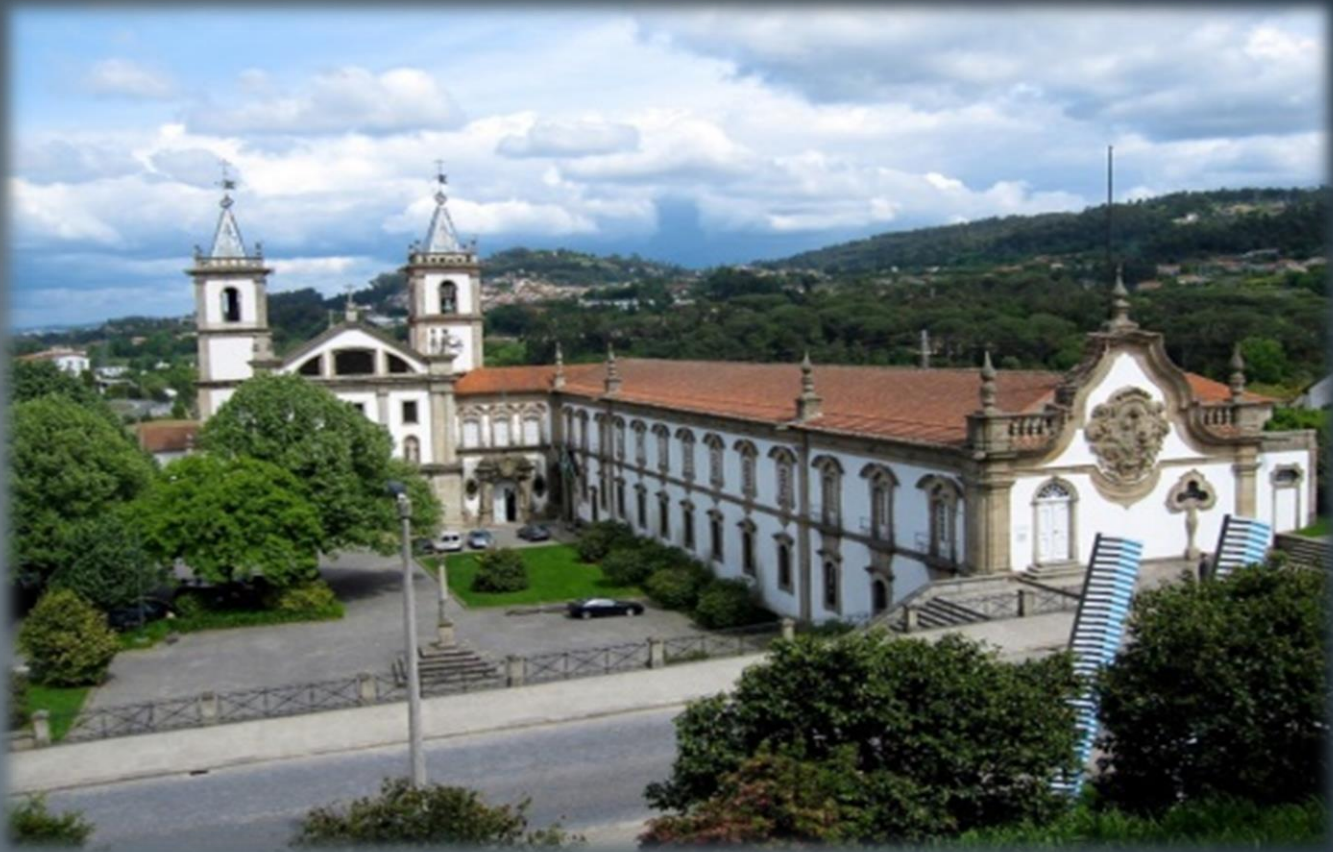
S. BENTO'S MONASTERY/CHURCH, 10th century