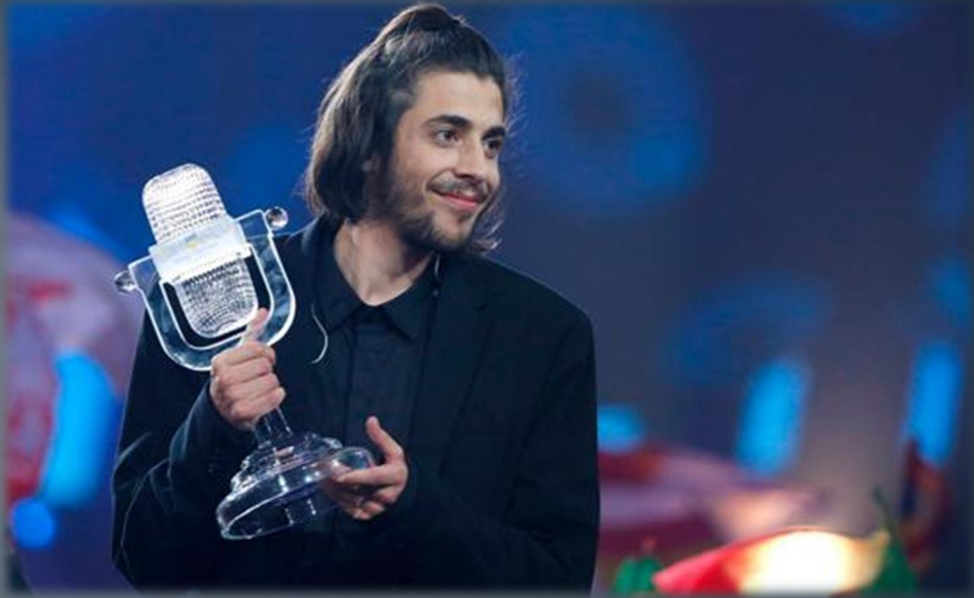
MUSIC – Salvador Sobral, winner of the European Song Contest 2017