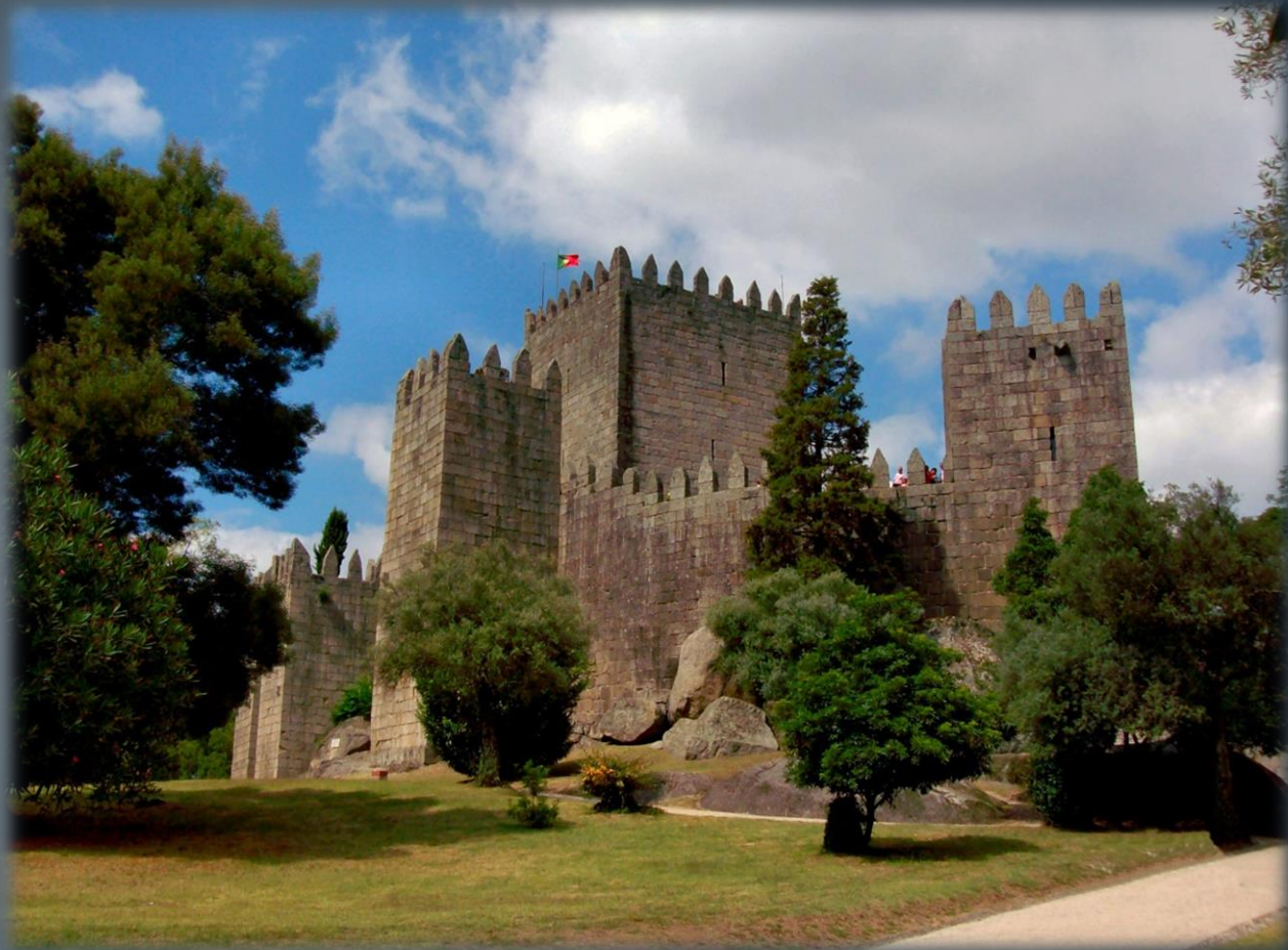
CASTLE OF GUIMARÃES, 10th Century