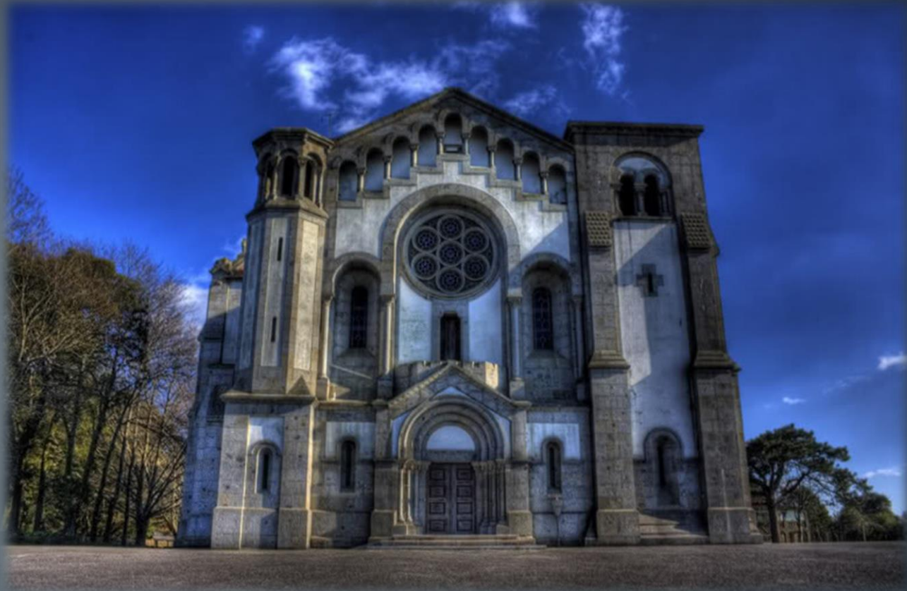
SANCTUARY OF SENHORA DA ASSUNÇÃO, 1919