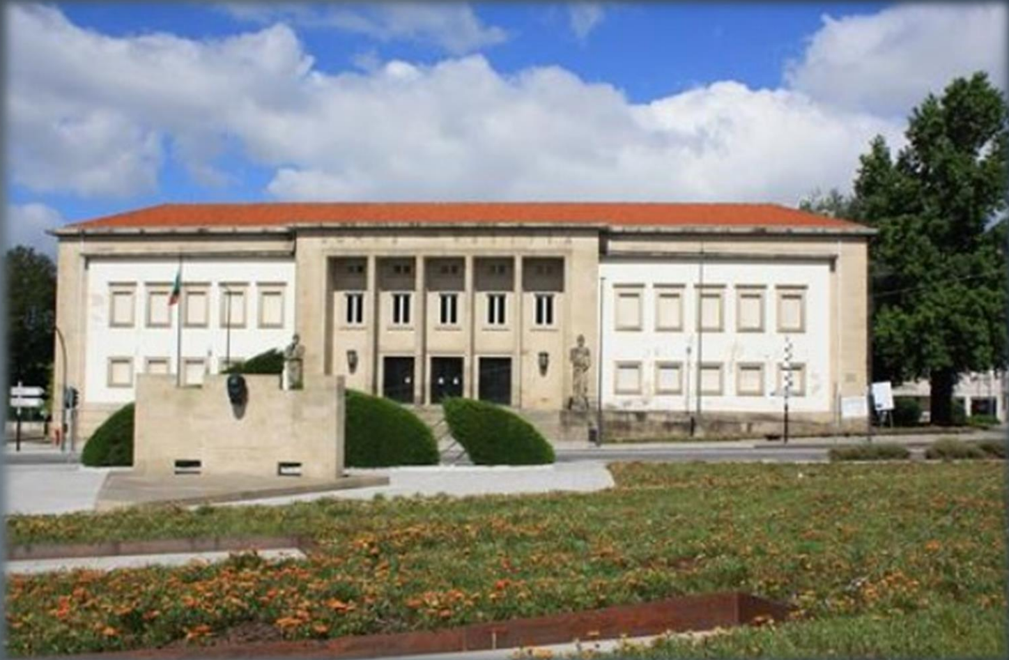
HOUSE OF JUSTICE