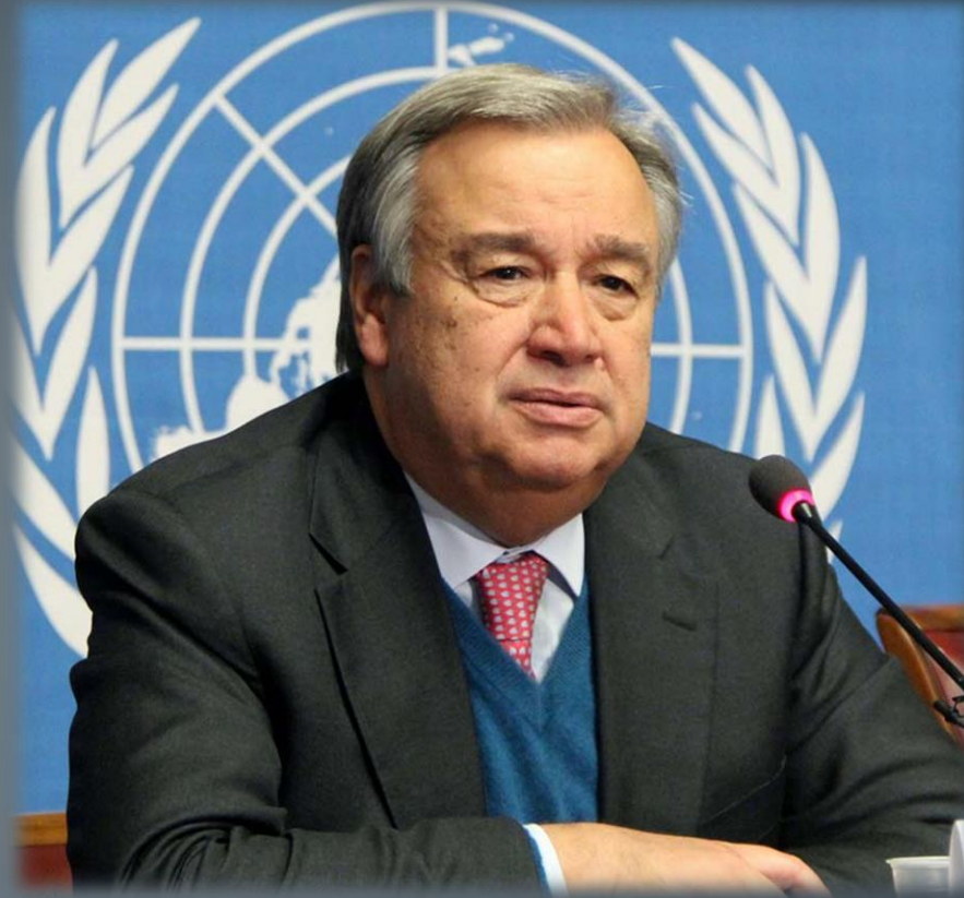
António Guterres - Secretary-General of the United Nations