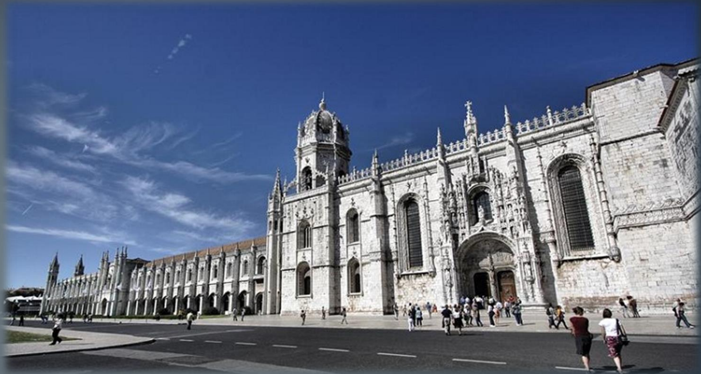
MONASTERY OF JERÓNIMOS, Lisbon, 1601