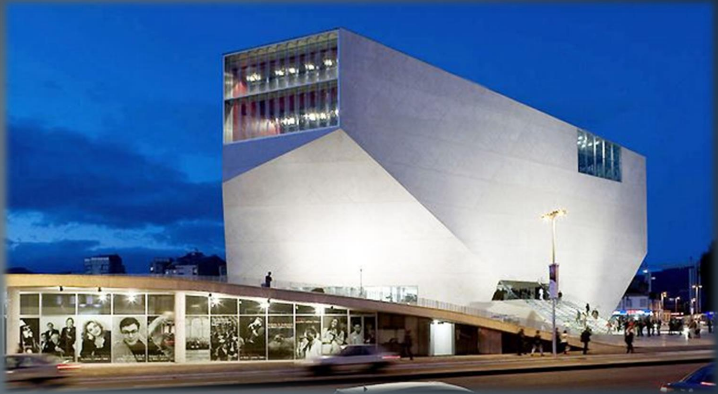
HOUSE OF MUSIC, 2005