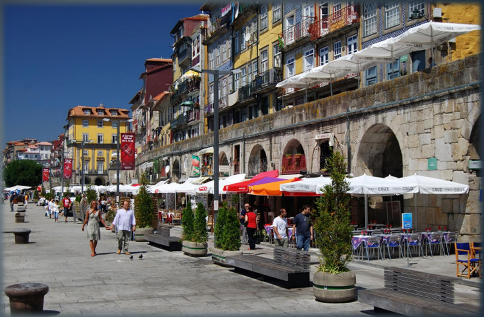
RIBEIRA – Douro's River Side