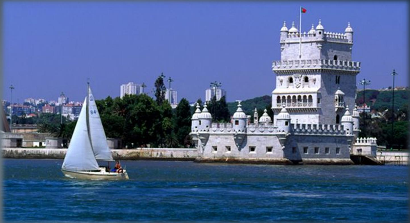
TOWER OF BELÉM, Lisbon, 1520