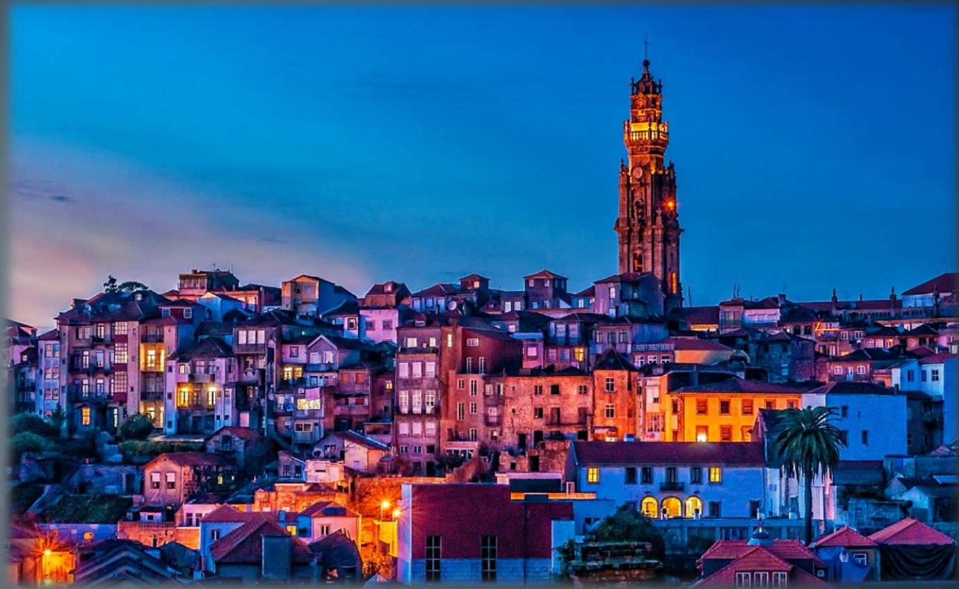
CLÉRIGO'S TOWER, 1750