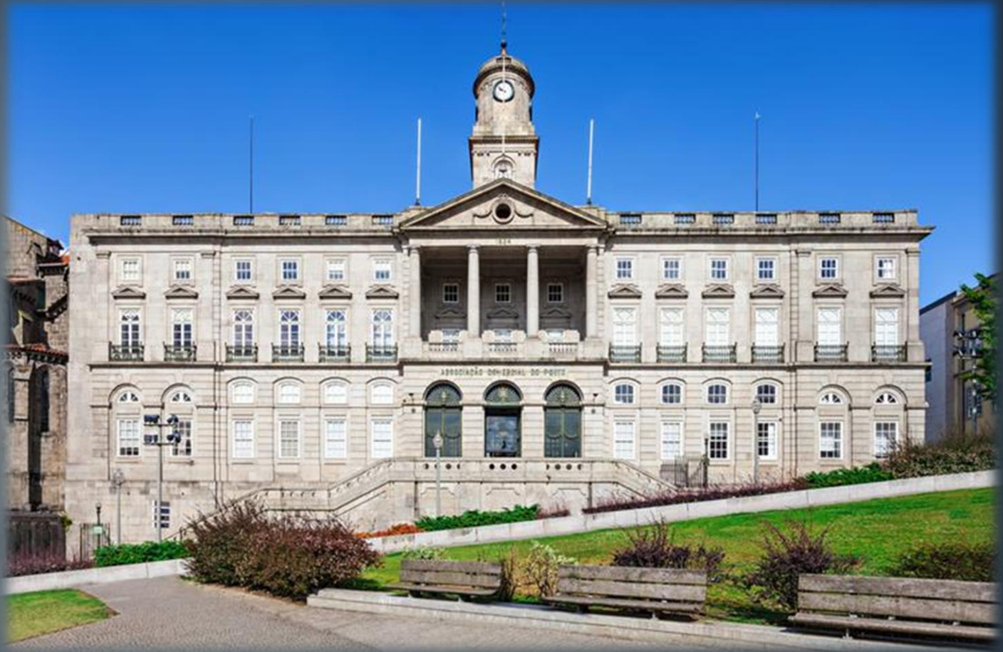
COMMERCE'S PALACE, 1880