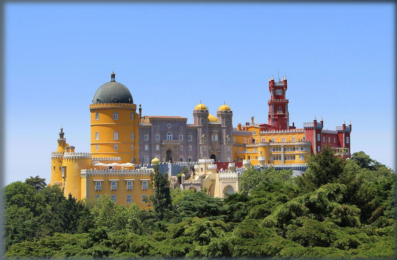
PENA PALACE, Sintra, 1847