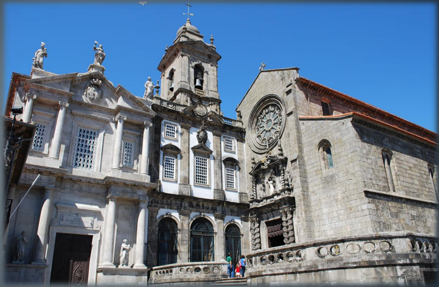
S. FRANCISCO'S CHURCH, 1410