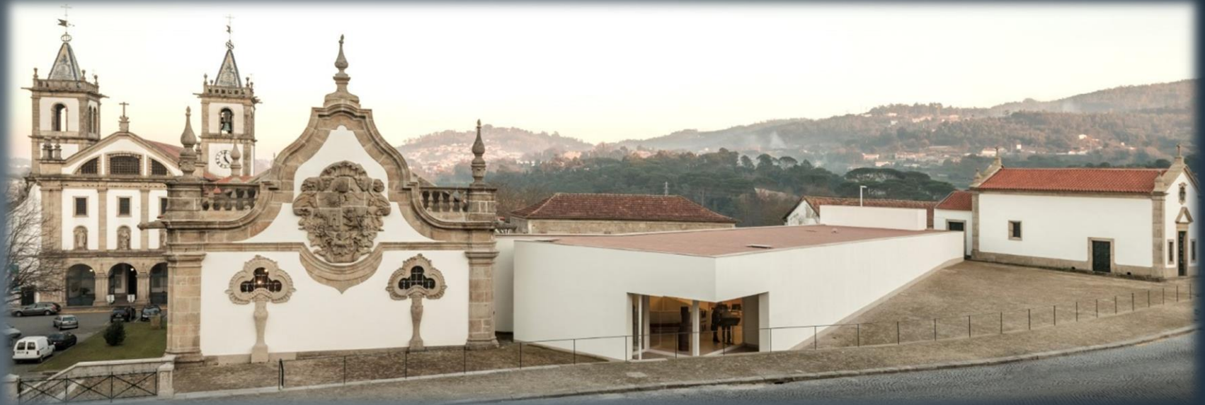
ABADE PEDROSA MUSEUM