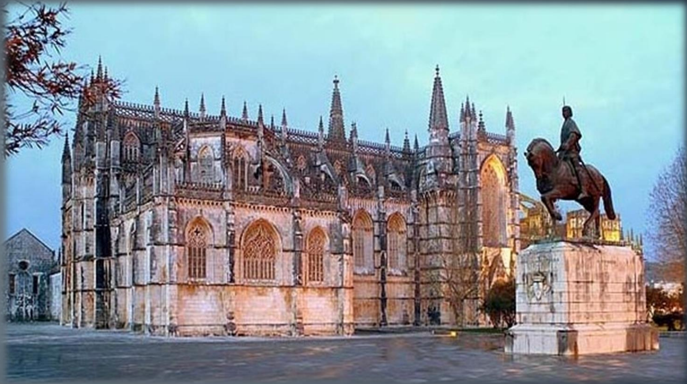
MONASTERY OF BATALHA Central Region of Portugal, 1517